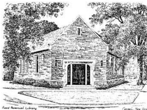
Reed Memorial Library Carmel, New York