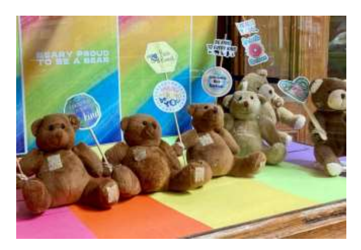
"Love how inclusive this is!"