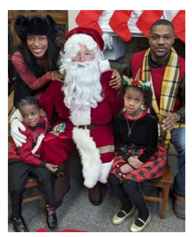
"Wonderful time! Thank you Santa and all the Reed Library elves."