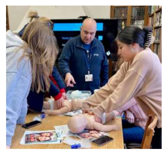
"I'm so delighted you are doing so much there. Kudos to the staff."