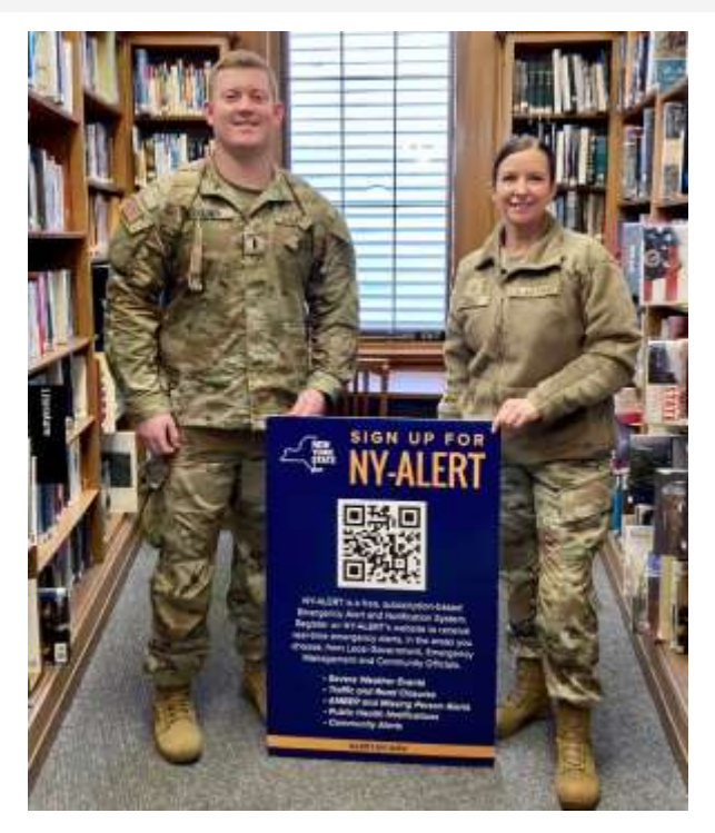
"Thank you for being the special people you are and for all you do to make Reed such a welcoming place in our community."